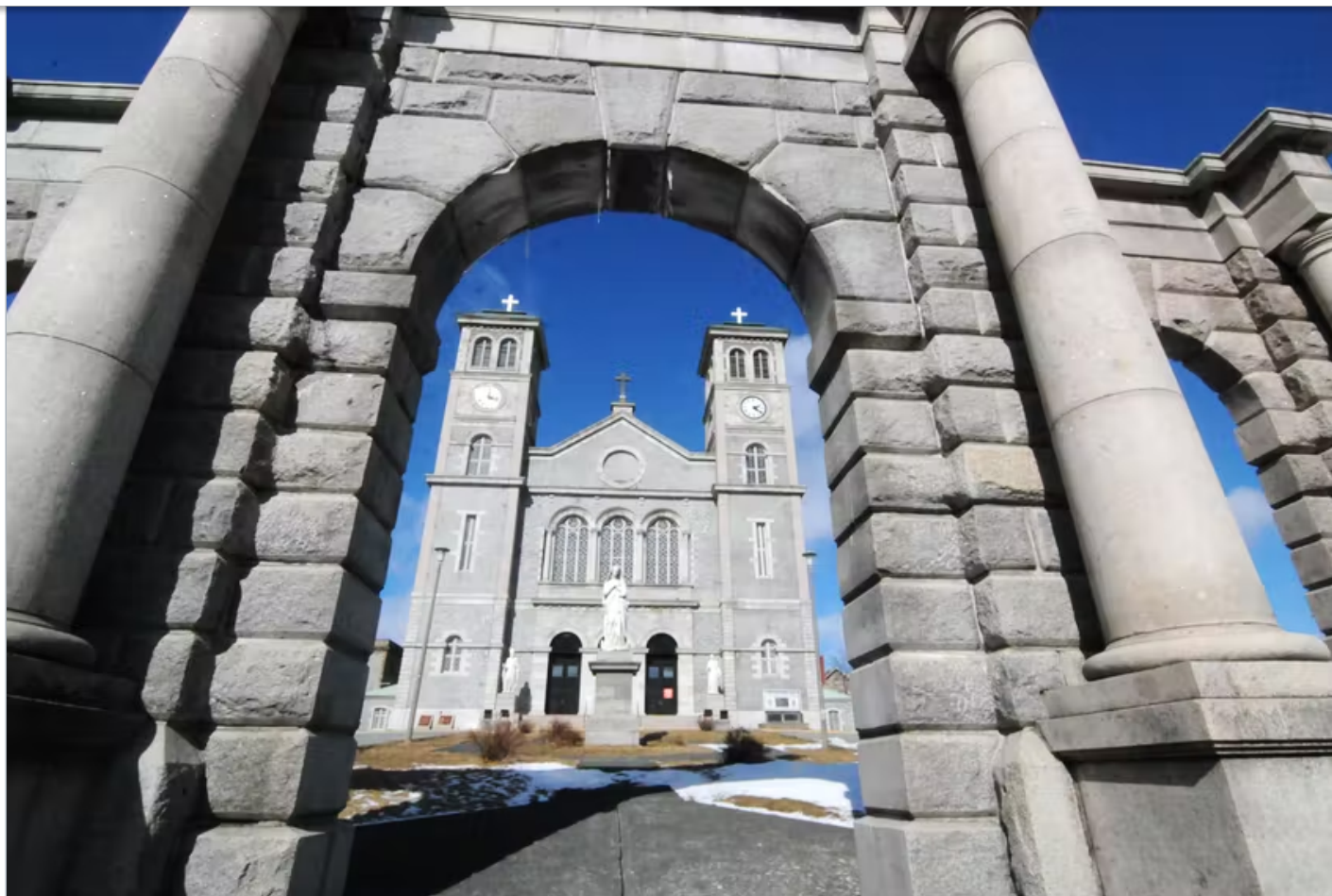
The Roman Catholic Basilica of St. John the Baptist on Military Road in St. John's.

STORY CONTINUES BELOW THESE SALTWIRE VIDEOS