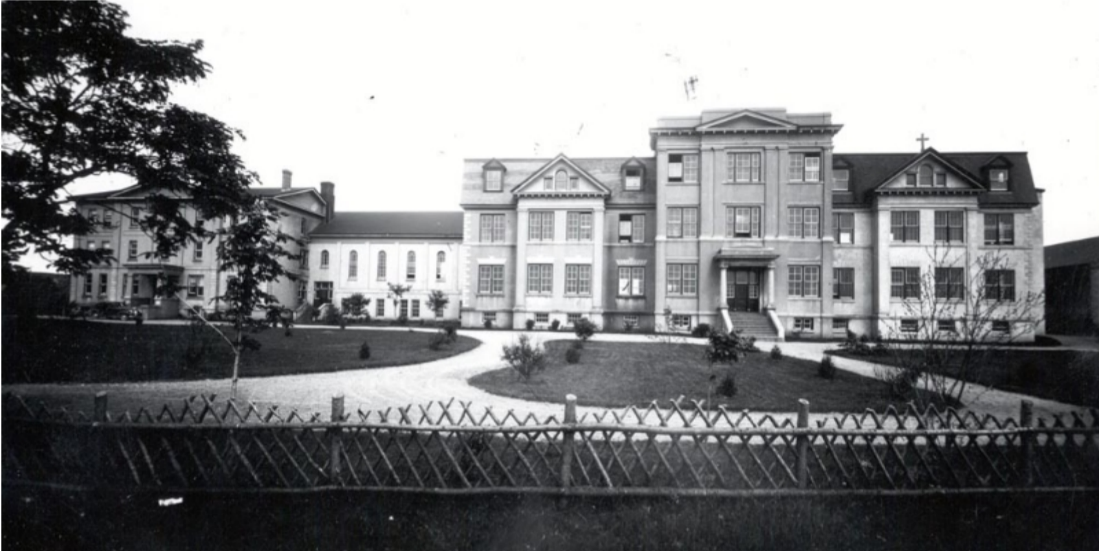
(Mount Cashel Orphanage, circa 1942.)

The lawyer representing victims of sexual abuse at Mount Cashel Orphanage in the 1940s, 50s and 60, says his clients are relieved but tired.